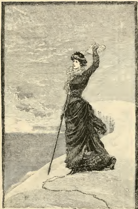
A VISION ON A SUMMIT