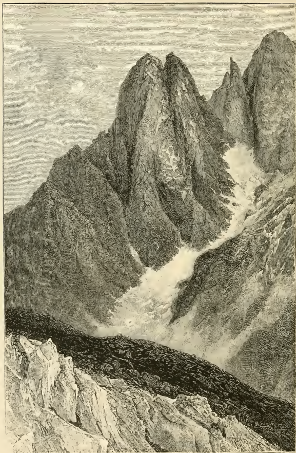
THE AIGUILLE DU DRU FROM THE SOUTH