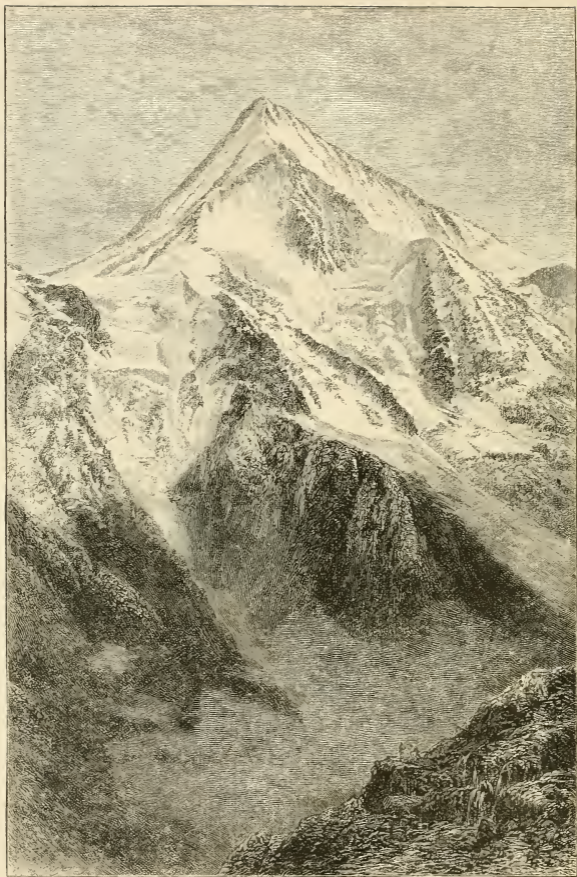
THE BIETSCHHORN. FROM THE PETERSGRAT